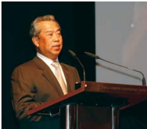
Deputy Prime Minister Muhyiddin Mohd. Yassin delivering opening remarks.

T he Malaysia Productivity Corporation (MPC) successfully organized the International Convention on Quality Control Circles (ICQCC) in conjunction with the Annual Productivity & Innovation Conference and Exposition (APIC 2012) with the theme From Ideas to Reality, 15–17 October 2012, at the Kuala Lumpur Convention Centre. The APIC 2012 combined four of the MPC's major programs: National Innovative and Creative Circle Convention; National Quality Environment (5S) Convention; Productivity Conference; and CEO Masterclass. The exposition also showcased product and process breakthroughs by practitioners, academic researchers, and industry players featuring creative ideas in areas of productivity, innovation, and competitiveness. A total of 12 countries with 221 circles participated and made presentations at the ICQCC 2012, representing Bangladesh, the ROC, Japan, Hong Kong, India, Indonesia, the ROK, the Philippines, Singapore, Sri Lanka, and Thailand, in addition to the host country.