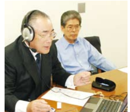
APO expert delivering a lecture online

The APO organized a 10-day e-learning training course on Customer Relationship Management (CRM), 6–17 October 2008. The objective was to promote CRM in the private sector, especially SMEs, in member countries to assist in the development of trained manpower, marketing specialists, and decision makers.