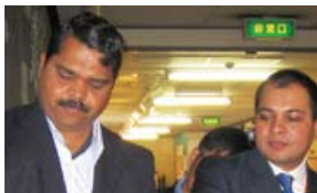
p. 5, Conference, Japan