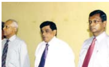
p. 8, APO Alumni, Sri Lanka