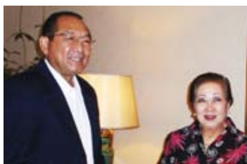
p. 7, Meeting, Philippines