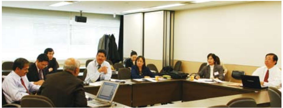
Committee members discussing new training framework

Last year, the APO organized three pilot in-country training programs to train more member country practitioners. This was in addition to the regular basic and advanced training courses held in the Philippines in October and in Malaysia in November, respectively. These training courses introduced participants to various productivity concepts and techniques, providing in-depth knowledge of and skills in productivity improvement activities and problem solving. Practitioners must be able to diagnose an organization’s current productivity performance, create solutions for improvement, and implement them. Practitioners must also be able to deliver and disseminate productivity enhancement knowledge effectively. Therefore, they must have excellent presentation, com-