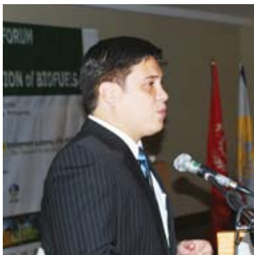
Senator Zubiri speaking on the Philippines Biofuels Law

Countries all over the globe are turning to biofuels to reduce dependence on fossil fuels. Governments are pursuing policies to reduce fossil fuel use not only for energy security but also to slow global warming and meet environmental goals. Both are important topics in the APO's Green Productivity (GP) Program. The Asia-Pacific Forum on Sustainable Production of Biofuels held in Manila, 26–28 November 2008, addressed a host of important issues related to biofuel production.