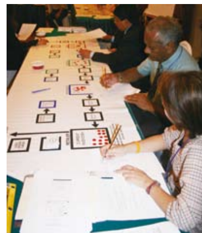
System dynamics modeling exercise

Institute, Thailand, conducted the World Café sessions. System thinking uses system dynamic modeling to simulate complex problems in policy management, and the World Café approach involves creating healthy ecosystems through consensus building with inputs from multiple perspectives for policy development and planning. A short site visit was also made to a model public-sector enterprise, the Korean Gas Corporation, which showed how a sustainable management policy is implemented in real life.