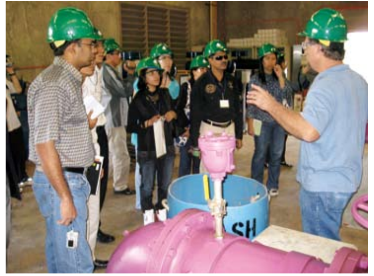
A local expert explaining water reclamation

Additionally, the DBEDT initiated a business-matching session with local environmental business companies. The session allowed participants to discuss spe-