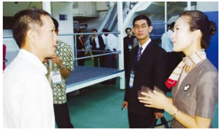
Participants learning about Asiana Airlines' CRM activities Multicountry observational study mission on Customer Relationship Management (CRM), Republic of Korea, 3–6 August 2009.

Kindly contact your NPO for details of future activities, including eligibility for participation. The project details along with the address of your NPO are available from the APO Web site at www.apo-tokyo.org .