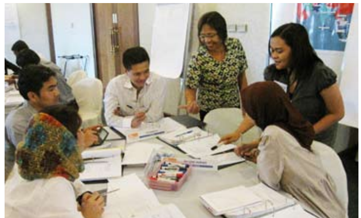
Discussing productivity promotion strategies Training course on Development of Productivity Practitioners: Basic Program, Philippines, 6–31 July 2009