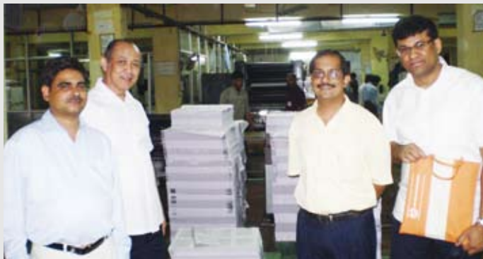
Evaluation team at Adarish Printers, Bhopal, India

ductivity and four a ‘high’ impact. This was supported by operational impacts that are clearly visible to both managers and employees.” Regarding the TES projects, he stated, “Recipients were aware of the positive impact but were also cognizant of improvements needed in TES. The majority of improvements suggested were measures to sustain learning and practice beyond the consultancy period.”