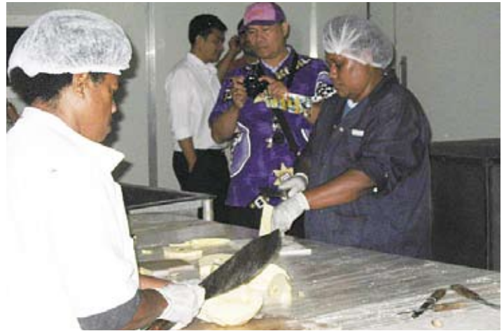
Preparing breadfruit for processing

At the end of the seven-day training course, participants agreed that value ad-