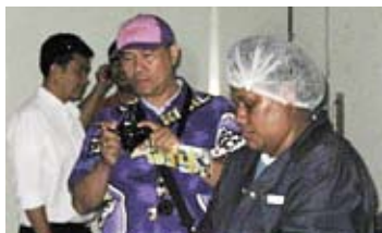
p. 5, Training course, Fiji