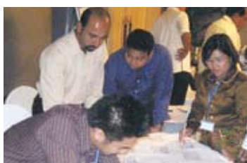
p. 6, Training course, Sri Lanka