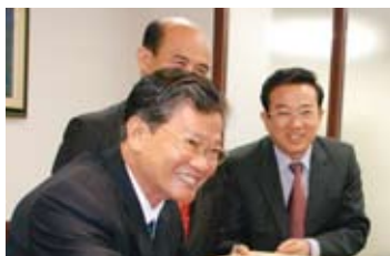
p. 6, BCBN, Japan