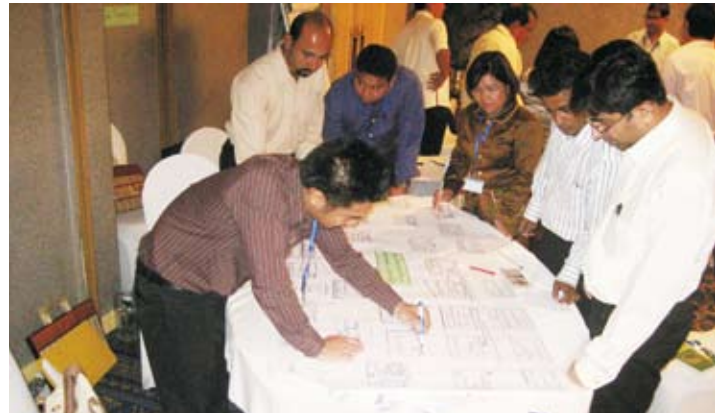
Group design of a food safety management plan