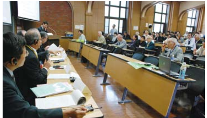
Panel discussion in progress