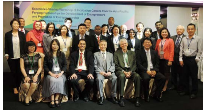
Delegates full of cheer after developing a set of concrete recommendations to promote entrepreneurship in the Asia-Pacific region.