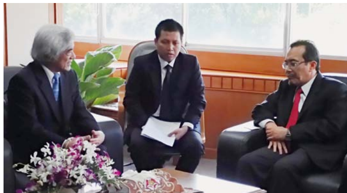
Secretary-General Amano visiting Indonesia Minister of Agriculture Dr. Suswono on 1 July.