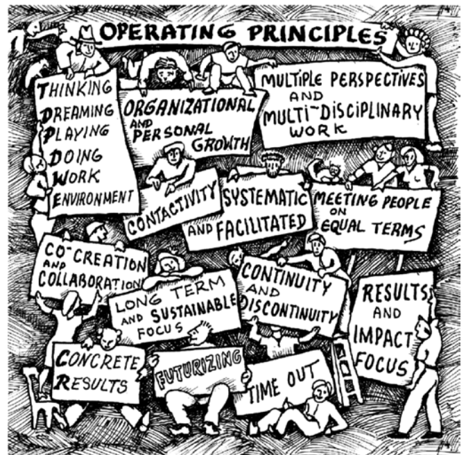
Figure 2. Operating principles of future centers. Illustration by A. Dvir in OpenFutures—An Operating System for Future Centers (R. Dvir, editor, Brussels: OpenFutures, 2008).

In a vast variety of shapes and forms, and under diverse names in different sectors, future centers are proving to be powerful instruments for supporting entrepreneurial discovery, developing knowledge economies, and creating sustainable changes in society. Whether the focus is on small steps or great leaps, developing an innovation dialogue in the organization and the community is essential. In this way, future centers contribute to open innovation, open government, and enhancing the creative power and problem-solving capacity of industry and society. The future is a moving target, and at a time when change is everywhere and standing still is equivalent to slipping backward, it is important to move with it. ☺