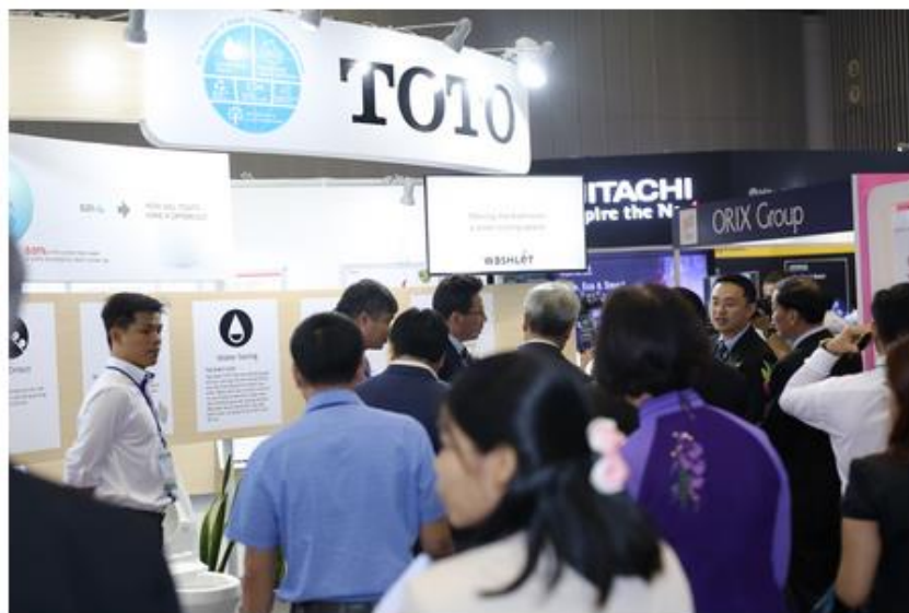
More than 170 companies attended the event, including those from Germany, Japan, Korea, and Thailand