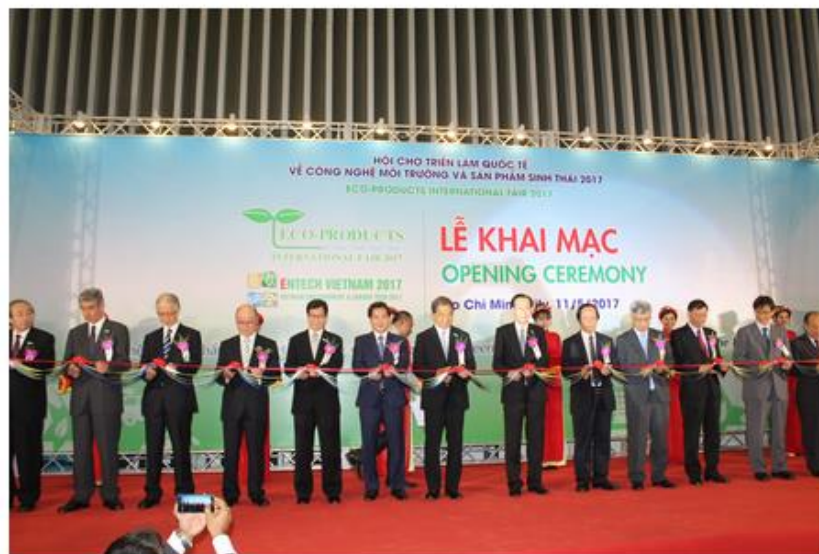
The opening ceremony of EPIF 2017

More than 170 companies from Germany, Japan, Korea, Thailand, and Vietnam have showcased their latest environmental technology solutions at the 11th Eco-Products International Fair (EPIF 2017) in an effort to promote sustainable productivity.