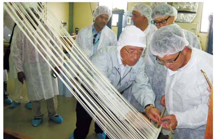
Demonstration of traditional hand-stretching of somen (wheat) noodles at the Ikeri Co. Ltd. factory in Miwa, Nara prefecture, during the multicountry observational study mission on Branding Local-specific Agricultural Products through the Use of Geographical Indications, 25-30 May, Japan.